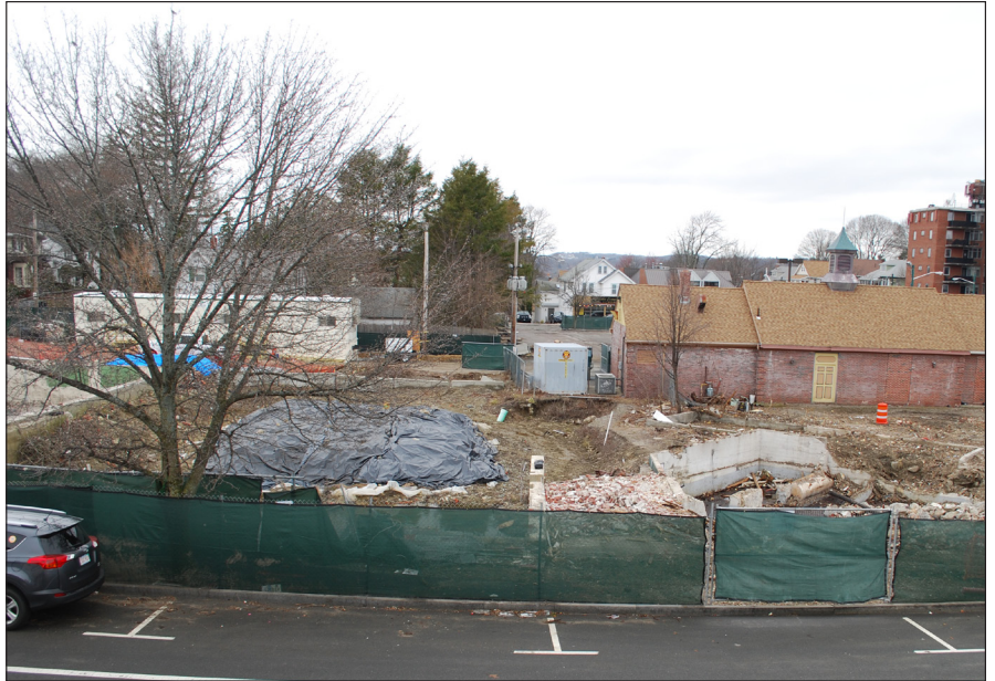
A partial view of the site from Common Street. The side of the Starbucks building, formerly Friendly's, is at right.