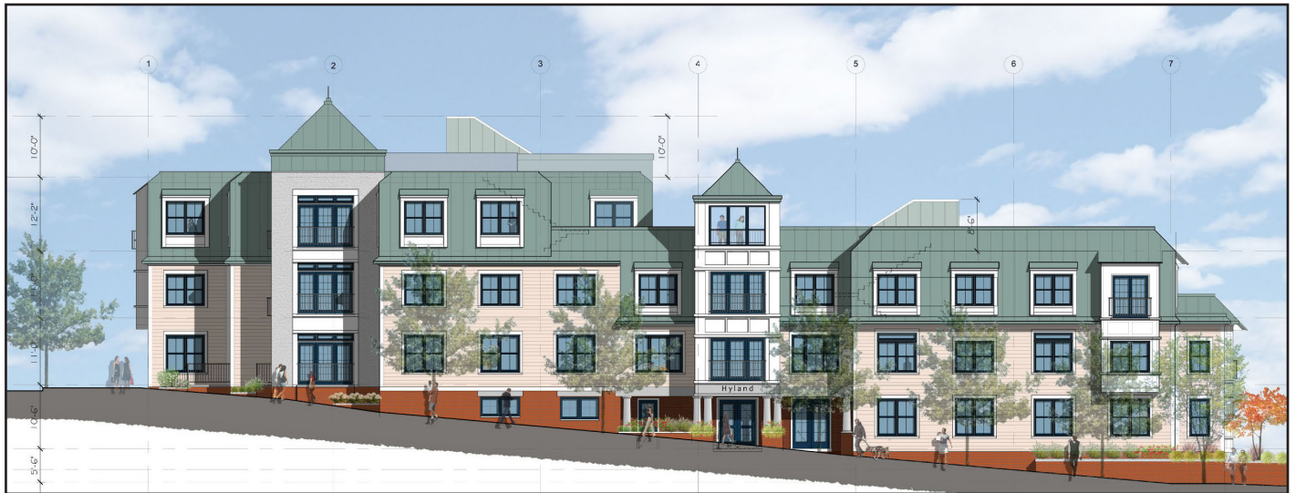
Artist rendering of the Cushing Village's Hyland Building, to be situated on Common Street.

the neutralization successful, Toll can ship and dispose of it less expensively as nonhazardous waste.