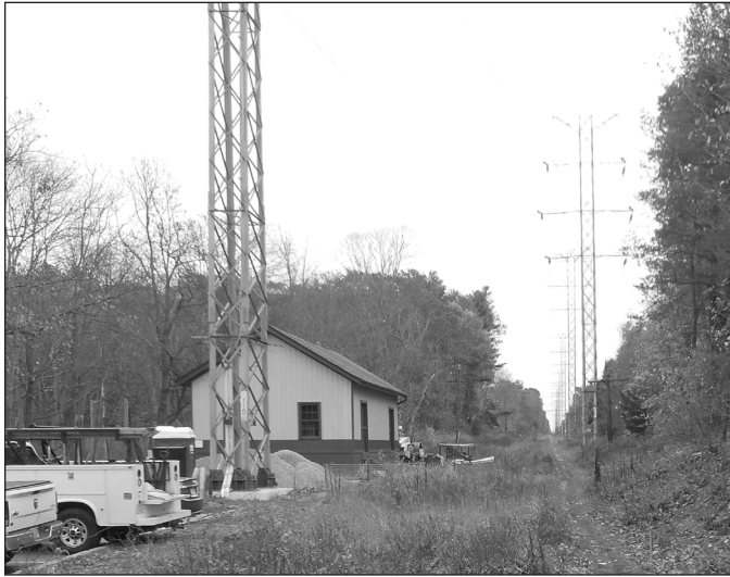
The MCRT right of way, looking eastward from the Wayland Depot Area.

SUDBURY. Going west from the Wayland project, again the right-of-way is shared with Eversource, which will build another access road, again doubling as the community path for the MCRT. That segment will include the rest of Wayland (another mile) and all of Sudbury (five-and-a-half miles), joining with the north-south Bruce Freeman Rail Trail, which continues through Framingham, Sudbury, Concord, Acton, Westford, Carlisle, and Chelmsford. This segment is advancing steadily, and will be the subject of an update in a future newsletter.