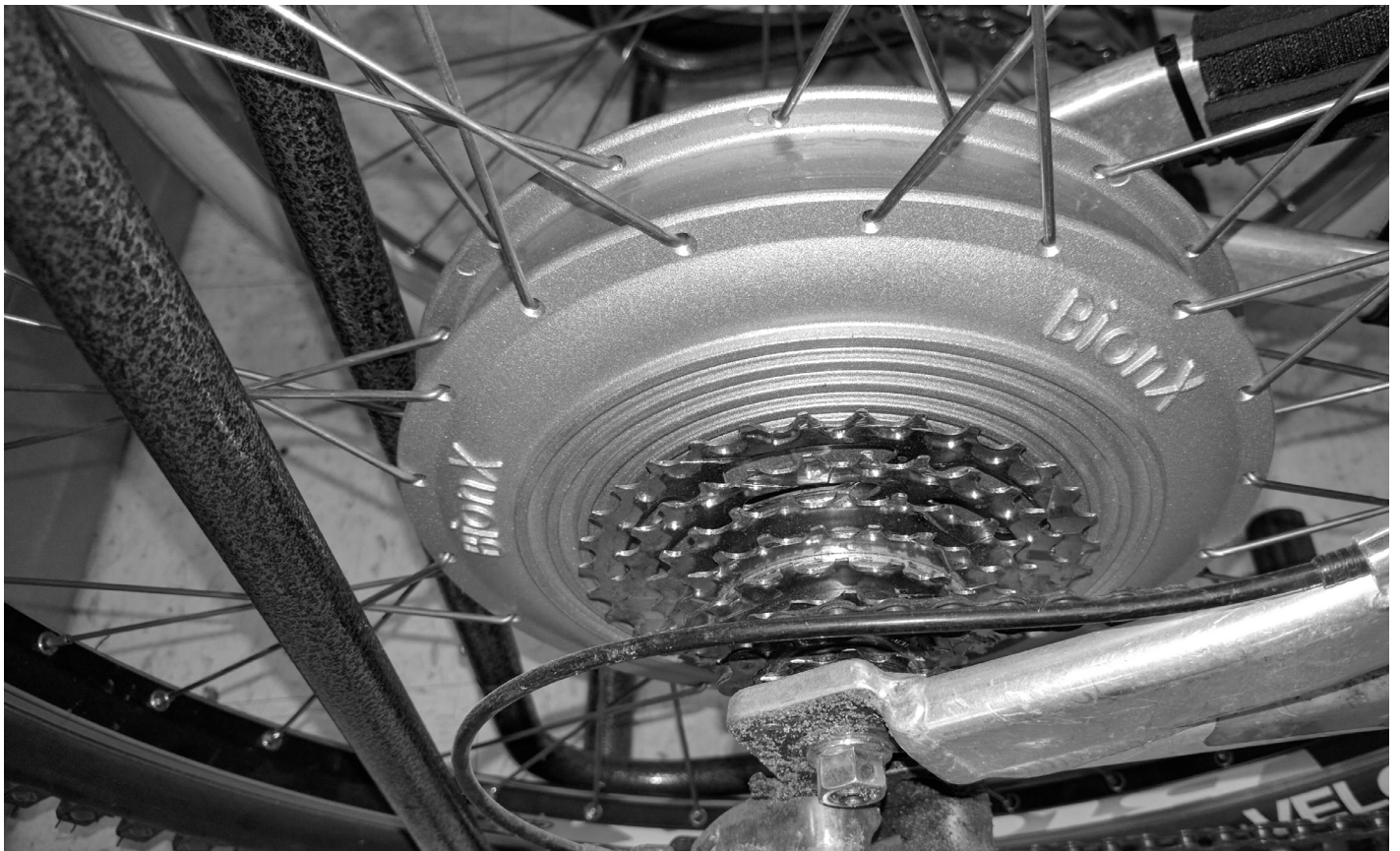
The BionX motor is integrated with the gears. This unit can be added to a non-electric bike.

The battery is mounted either to the frame or in a rack, and the control is typically located on the handlebars. Controls can be throttle-style (like a motorcycle or scooter) or proportional input. Proportional controls measure how hard you are pedaling and use that to determine how much electric-assist to add. If you rest, the motor rests; if you pedal hard, the motor runs more.