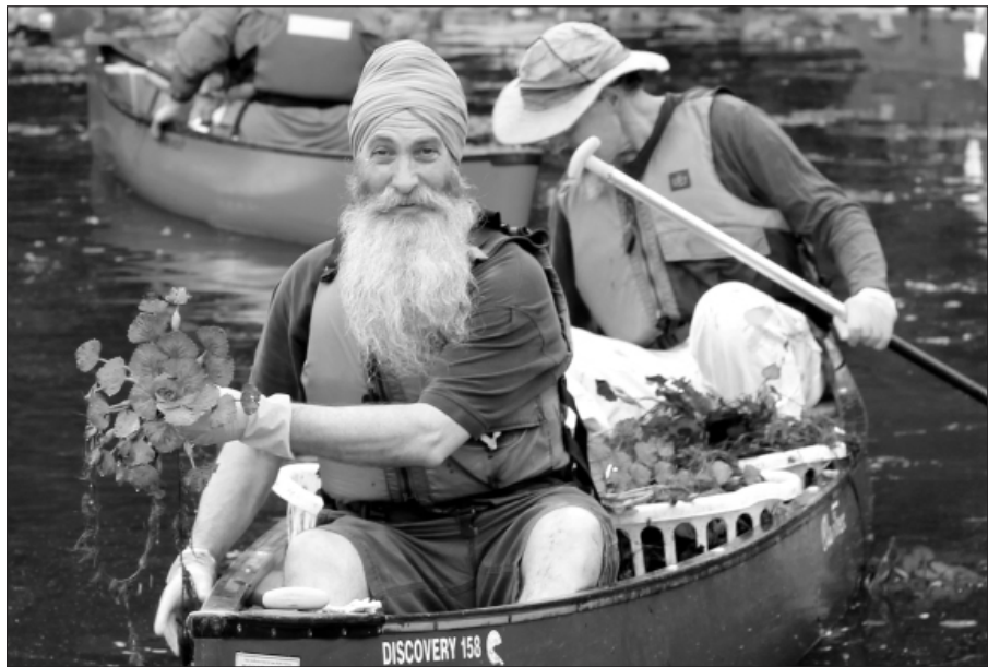
Khalsa, MyRWA staff, and volunteers spent many hours removing water chestnut plants from the Mystic River.

EKK: One of the big challenges was overcoming the skepticism when I said that the Mystic was a beautiful river worth our investment. Few people had seen the river from the water's