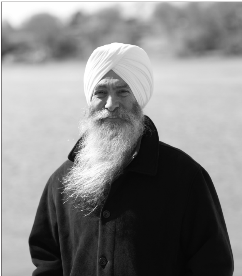
MYSTIC RIVER WATERSHED ALLIANCE

EKK: The most important change is the narrative of a forgotten, forlorn, polluted, urban waterway to the recognition that it is a vibrant living system full of fish,