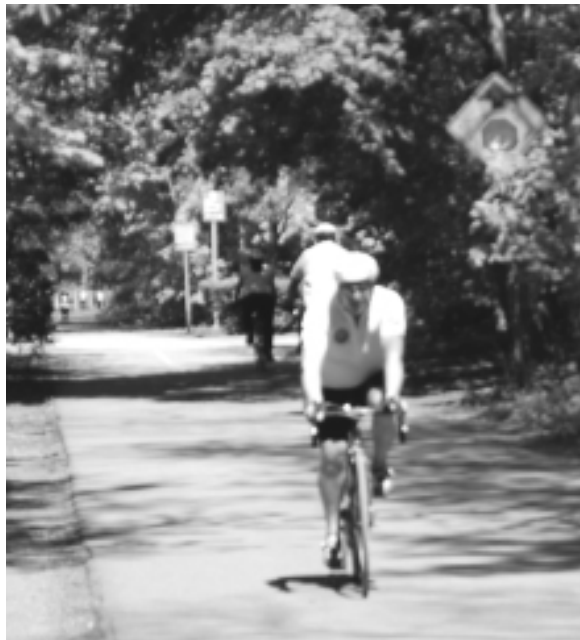
Enjoying the Minuteman Bike Trail in Arlington.

4. Bike facilities increase retail stores' visibility and sales. Among several studies, a San Francisco State University researcher found 66% of shops on San Francisco's Valencia Street reported business improved after the city reduced the road width, widened sidewalks, and added cycling infrastructure.