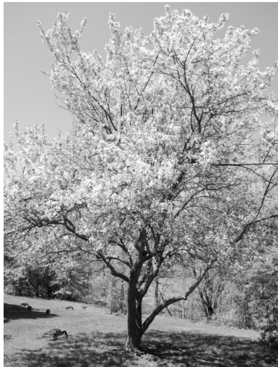
Spring finally blossomed at the pond.