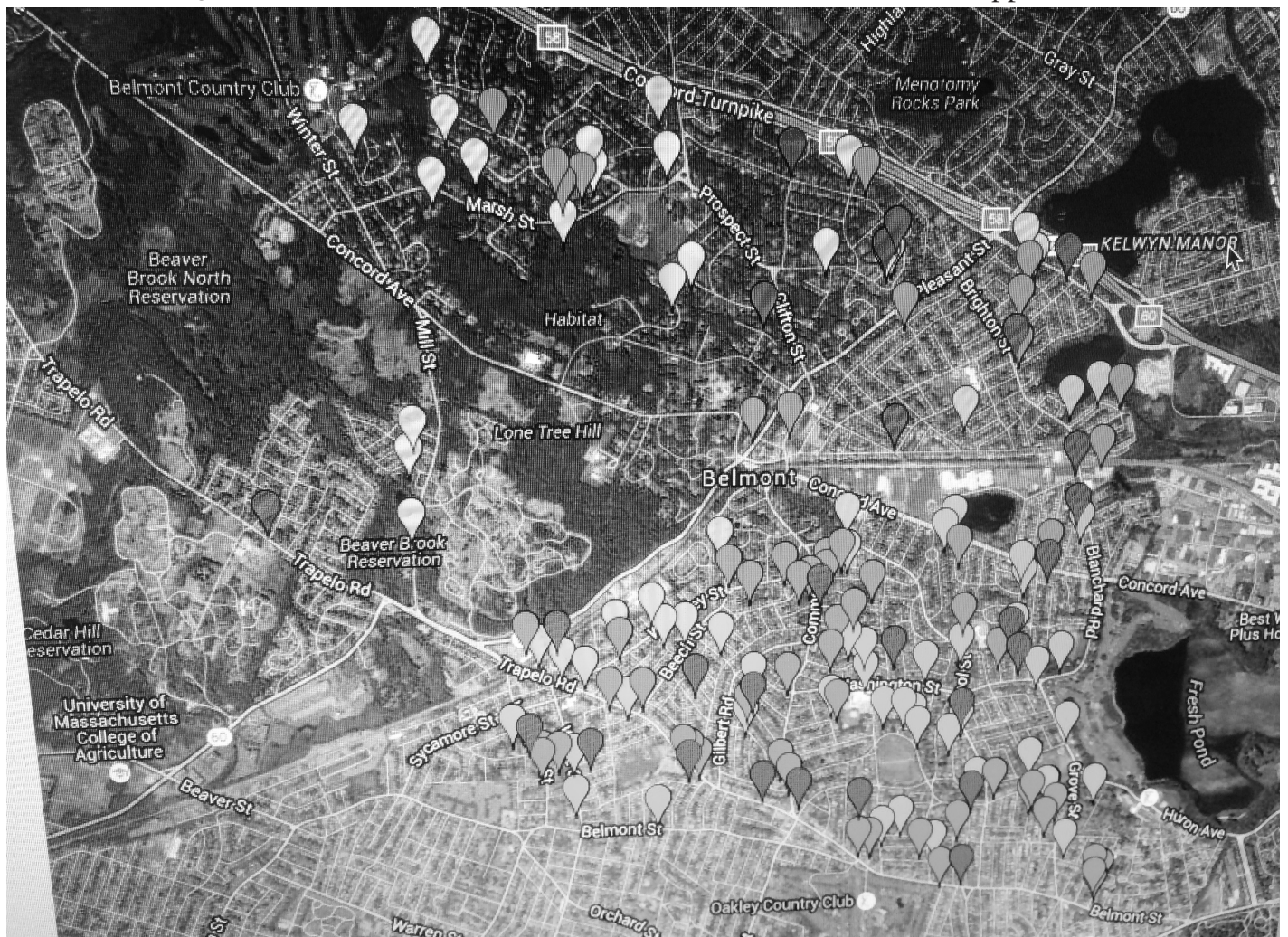
A map of Belmont from the nonprofit Home Energy Efficiency Team shows recent and current leaks of natural gas from rotting or damaged pipes or faulty connections. To see this in a color, interactive map, go to: http://bit.ly/1X92hHi

She was addressing an April 21 meeting of concerned citizens from Belmont and surrounding towns sponsored by Mothers Out Front (MOF), whose mission is “Mobilizing for a Livable Climate.” “We’re appalled and concerned