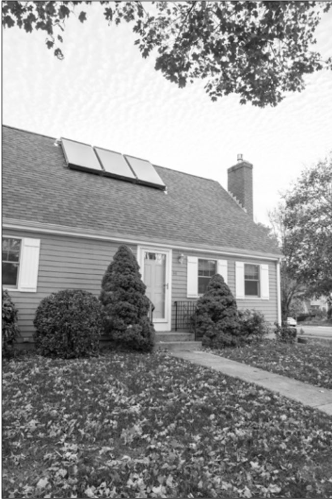
Solar panels on Alexander Road, Belmont.

At night, or other times when the solar panels are not generating enough electricity to power your home, you may draw electricity from the Belmont grid and pay the retail price for what you consume, like all customers.