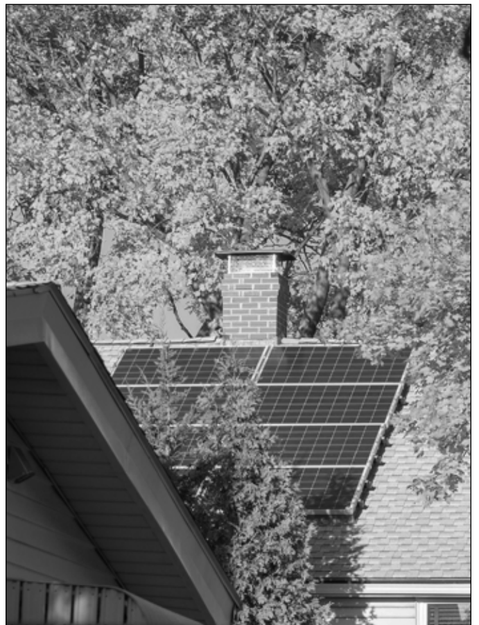
Slade Street solar panels in Belmont.

1. Contact a solar vendor to determine if your home is suitable for solar. A few local solar vendors are listed, without recommendation, in the box below. If your house receives enough sunlight to make solar panels economical, vendors will provide you with a proposal showing the cost of the system, amount of electricity your array will generate, amount saved each year in electric costs, and length of time to recoup your investment when all appropriate savings and incentives are included. You can