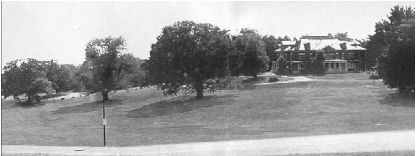
The "Upham Bowl" of the McLean central campus in 2001 (above) and in August 2012, with the Woodlands at Belmont Hill residences (below).