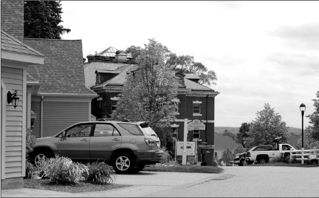
A view of the Upham Memorial Building from the Woodlands at Belmont Hill. The front (east) side of building is visible in the photos on the facing page.