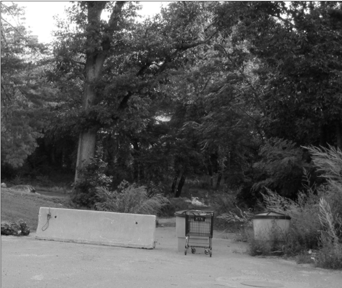
The entrance to the Belmont Technology Park site. A sketch of the unbuilt complex is available at www.massbio.org/writable/real_estate_listings/image_2/btp.jpg .