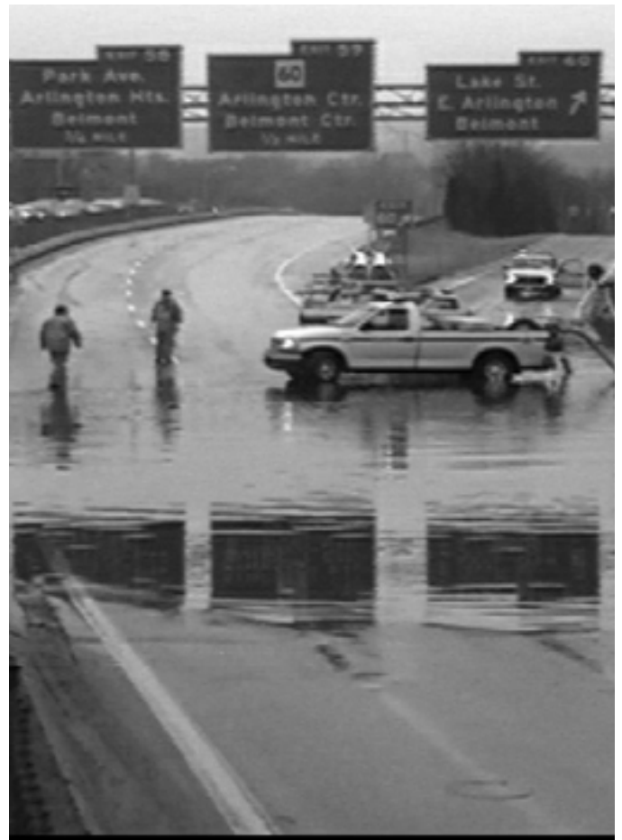
Flooding on Route 2 near Alewife, 2001.

The Belmont Citizens Forum is grateful for their support of this important event.