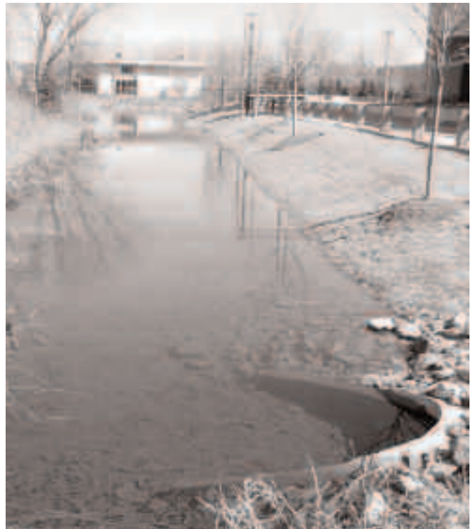
Stream beside Discovery Park; roadway is visible on the upper right.

My wanderings up and down the Little River tell me that today the Fresh Pond Marshes area is mostly ignored. Some homeless people live there, some people who live nearby go there to enjoy it, most people rush by. But it's still there, and though it's not nature primeval, it is nature. Its history says that it is both open to being shaped by human interventions and persistently itself. The area through which the Little River flowed in the 19th century is still a wetland for a reason. We can't change the fact that water goes where it needs to go. We're steadily moving away from the worst excesses of 19th-century industry and