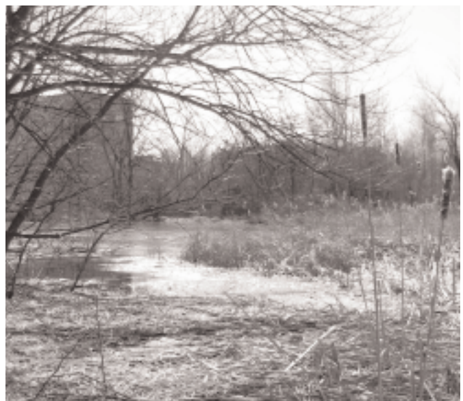
Marshy area near the Faces nightclub.