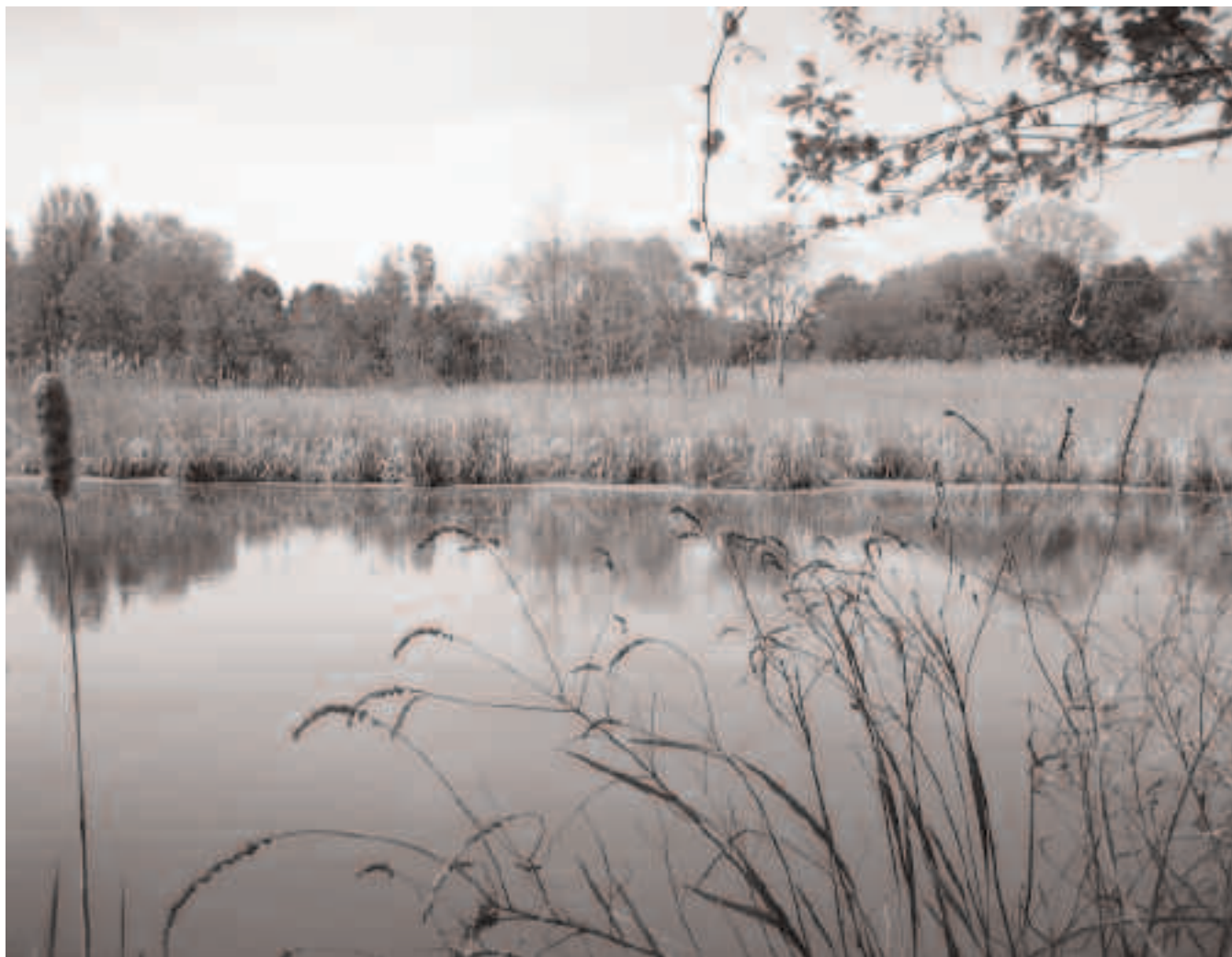
Fresh Pond Wetland, May 13, 2008.