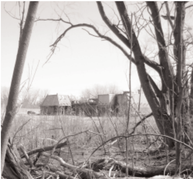
View of the Faces nightclub from the rear.

subject to multiple types of pollution. The worst offender was a slaughterhouse, built north of Fresh Pond in 1878, that dumped its waste into the wetlands. Cambridge and Belmont traded accusations about whose sewage was polluting the area. Malaria was rampant around the marshes.