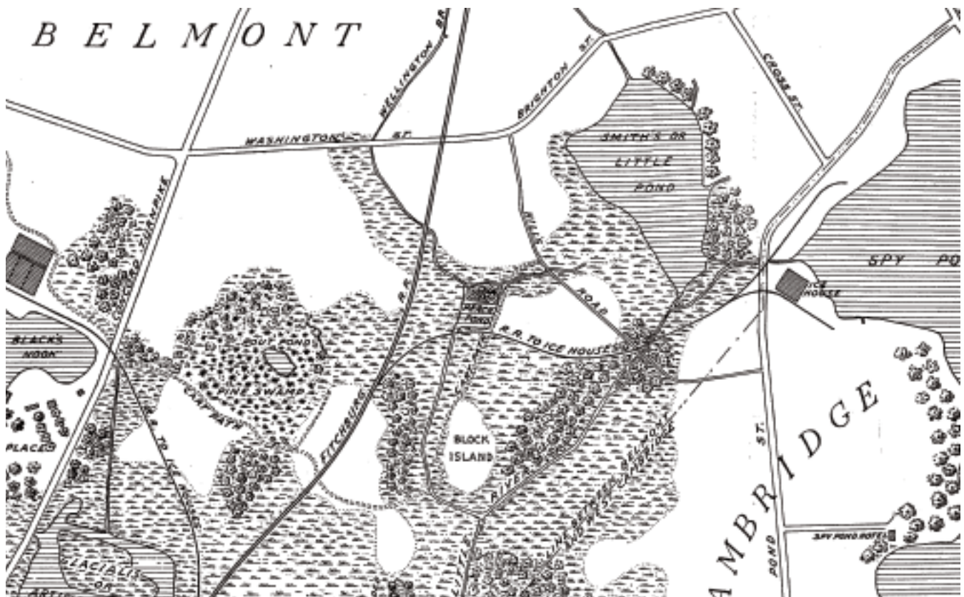
Fresh Pond and its Surroundings about 1866. William Brewster; The Birds of the Cambridge Region (1906). Cambridge Historical Commission

Where is the Little River now? Lowry Pei explores Belmont's historic waters, p. 14.