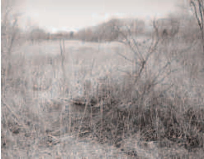
View across the road from the silver maple forest.

Along Acorn Park Drive, there's more left of the Fresh Pond Marshes than one might imagine while driving by in a car on Route 2.