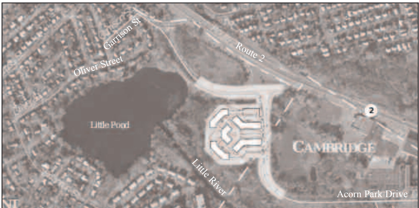
A map of the proposed Uplands development. Potential sewer lines are the thin gray lines connecting the Uplands location to Garrison Street in Belmont and Acorn Park Drive in Cambridge. The graphic is adapted from a map by Tetra Tech Rizzo, Inc.

The second current effort to fight the O'Neill development is being conducted by both the Coalition to Preserve the Belmont Uplands and Winn Brook Neighborhood and a group of 15