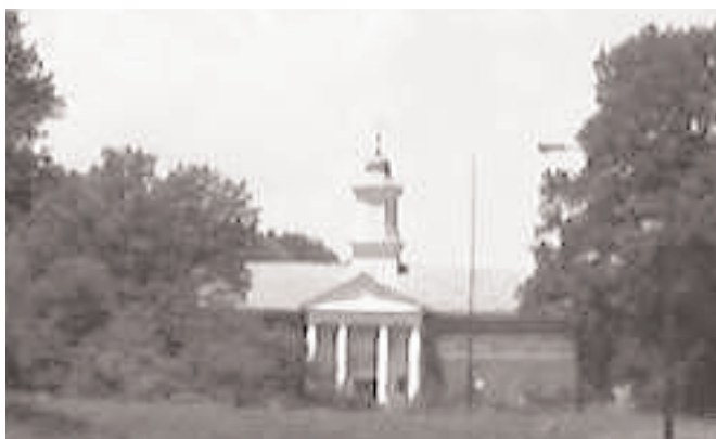
Metropolitan State Hospital Administration Building.