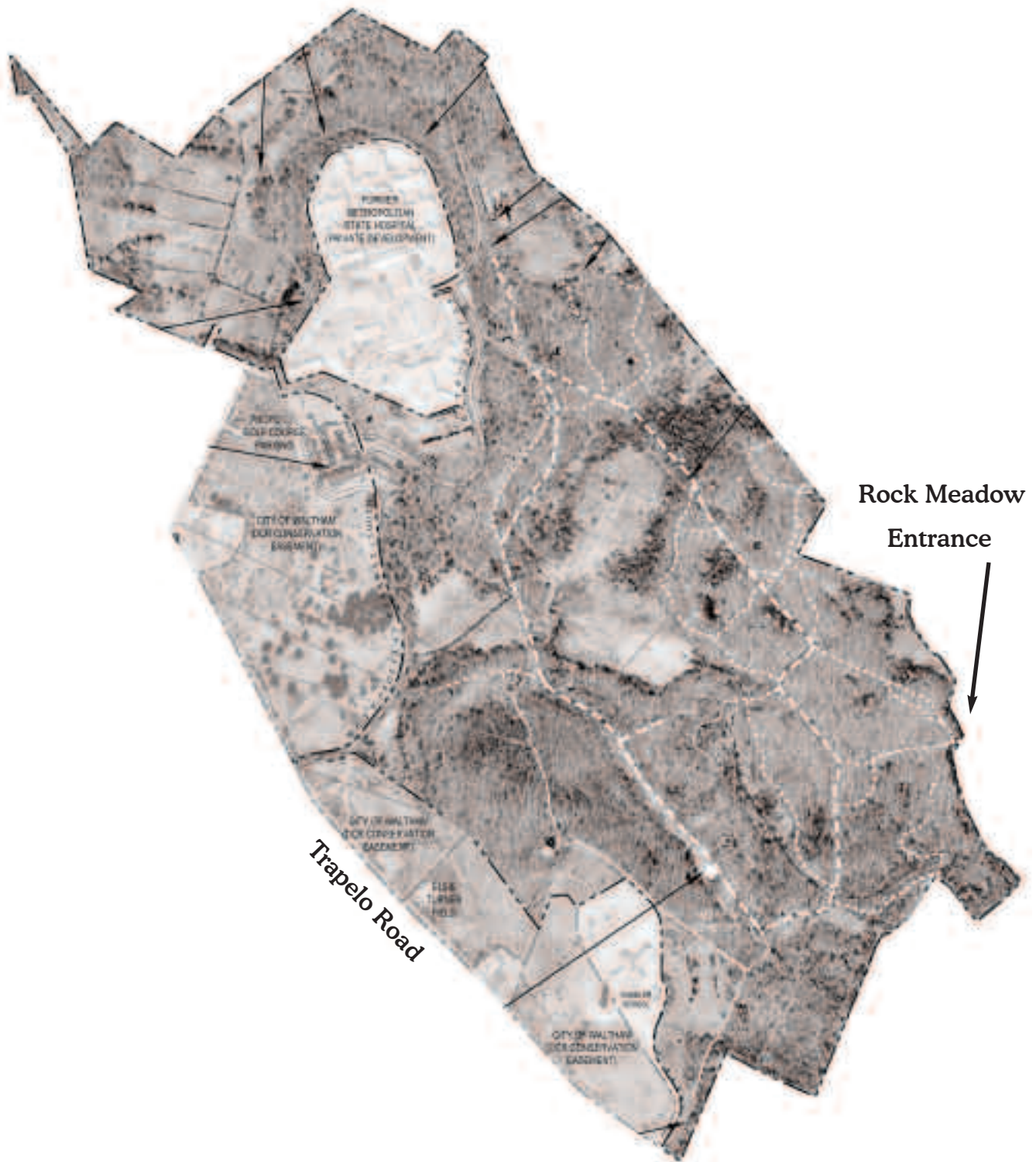
Beaver Brook North trail map. Broad carriage paths are shown by thick white dotted lines; thinner lines indicate smaller walking trails. Detail of a map of Beaver Brook North Reservation and surrounding areas prepared by the Massachusetts Department of Conservation and Recreation (DCR); used by permission of the DCR.