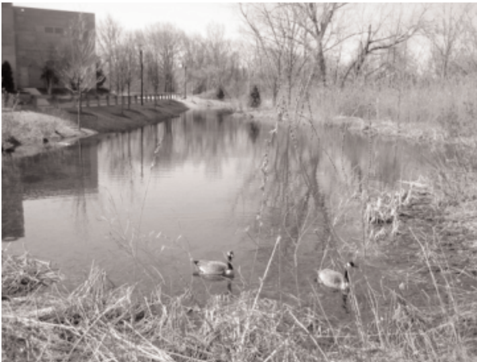
View through the back fence of the Susse Chalet.

People have been engineering this watershed for many years, by digging ditches to drain fields, re-channeling streams, damming Alewife Brook, and so on, for different reasons at different times. As population and industrialization grew in the late 19th century, the marshes (and the water supply of Cambridge and part of Belmont) were